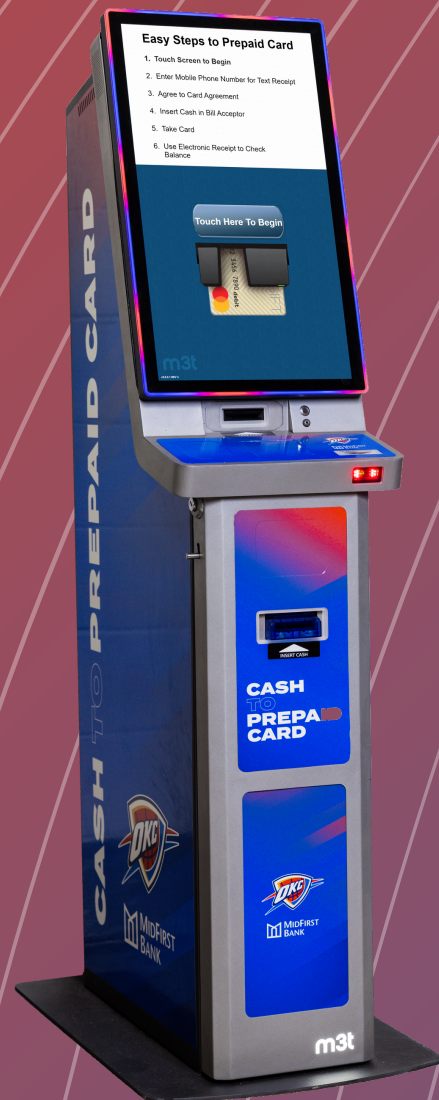
Model Shown Above: MC2190